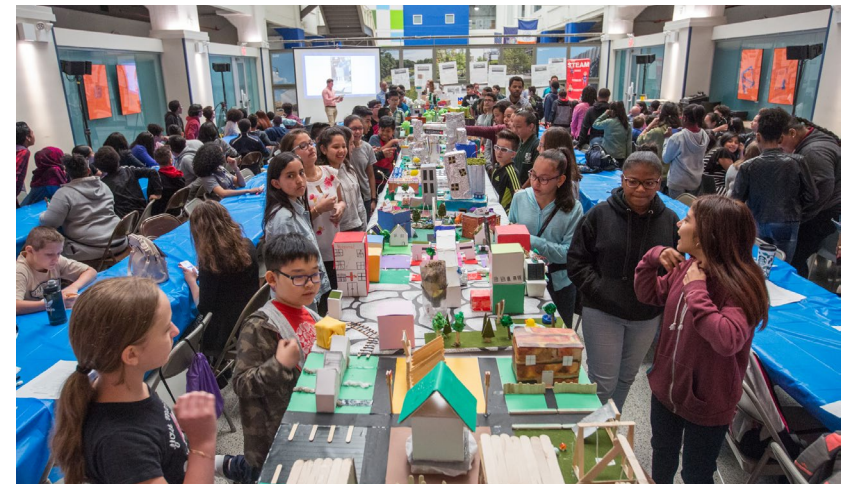
Example: NYC students presenting "Future City" model

Directions: Use the arts & crafts materials to create your perfect home, building, park, playground , or whatever you want! Work in groups, or by yourself.