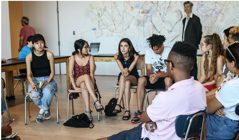
Example: Socratic Circle at the Whitney Museum

Directions: Choose a seat in the circle, introduce yourself, and engage in respectful, open, thoughtful discussion of what life at Riis Houses is like.