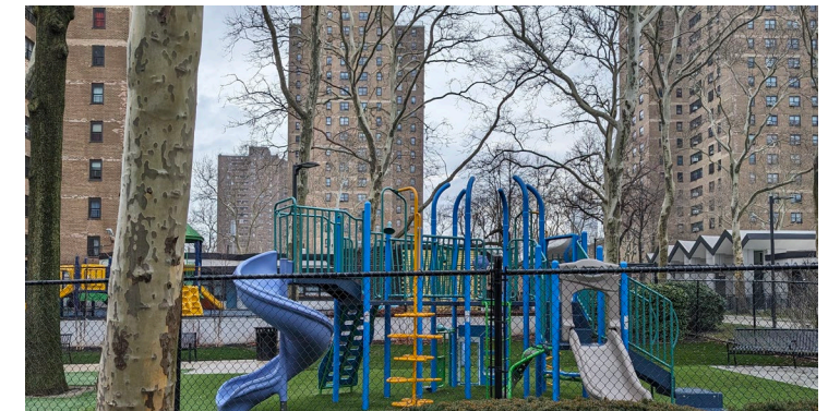
New Playground at Independence Towers