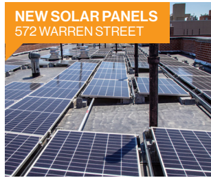
NEW SOLAR PANELS 572 WARREN STREET