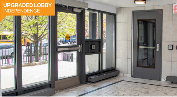
UPGRADED LOBBY INDEPENDENCE