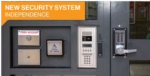
NEW SECURITY SYSTEM INDEPENDENCE