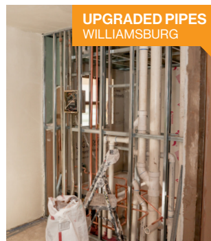
UPGRADED PIPES WILLIAMSBURG