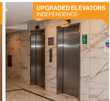
UPGRADED ELEVATORS INDEPENDENCE